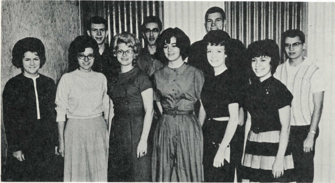
PIERRE RIGGS HIGH SCHOOL